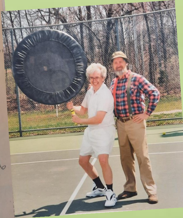
Left: Rick Green (as Bill Smith) and Right: Steve Smith (as Red Green) From The Red Green Show May 2, 1996

To the Stoney Creek Tennis Club, Play Safe + Heal Fast! Rick Green "Bill" Red Green Keep You Still in the Air May 2/96