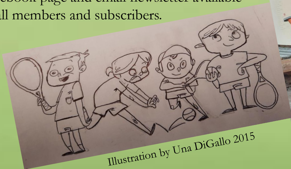
Illustration by Una DiGallo 2015