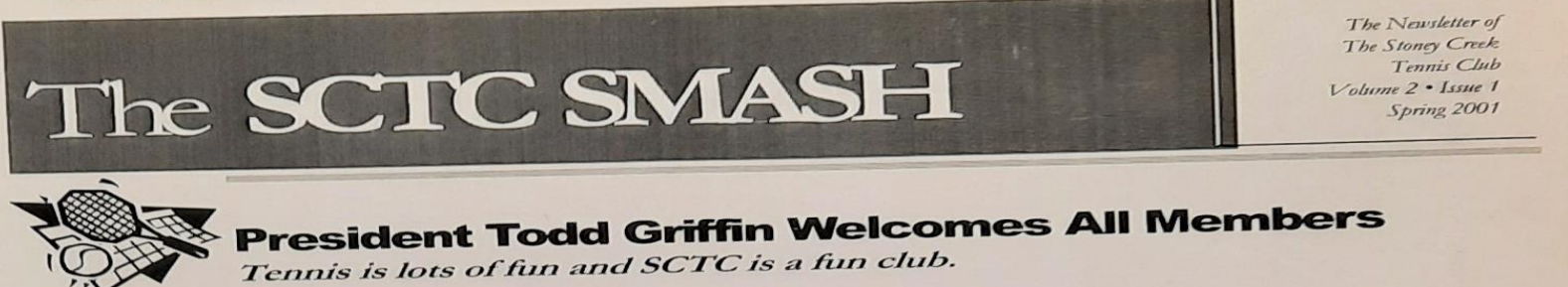
Stoney Creek Tennis Club Newsletter Heading "The SCTC SMASH" 2001