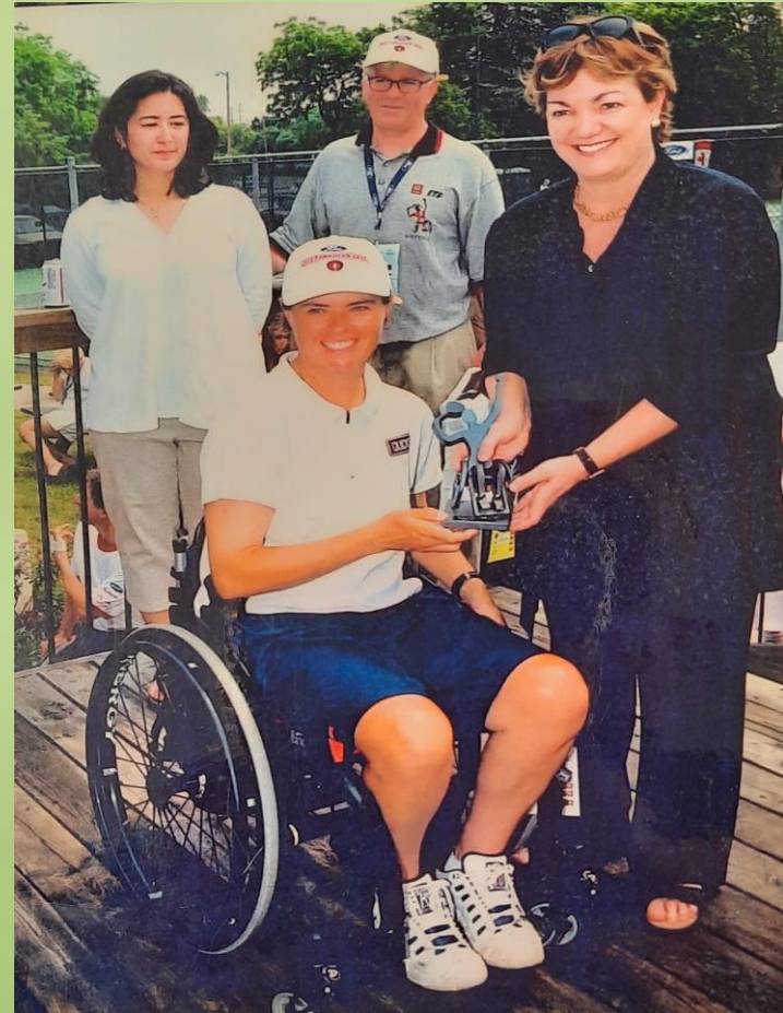
Sheila Copps attending a tournament in 2000