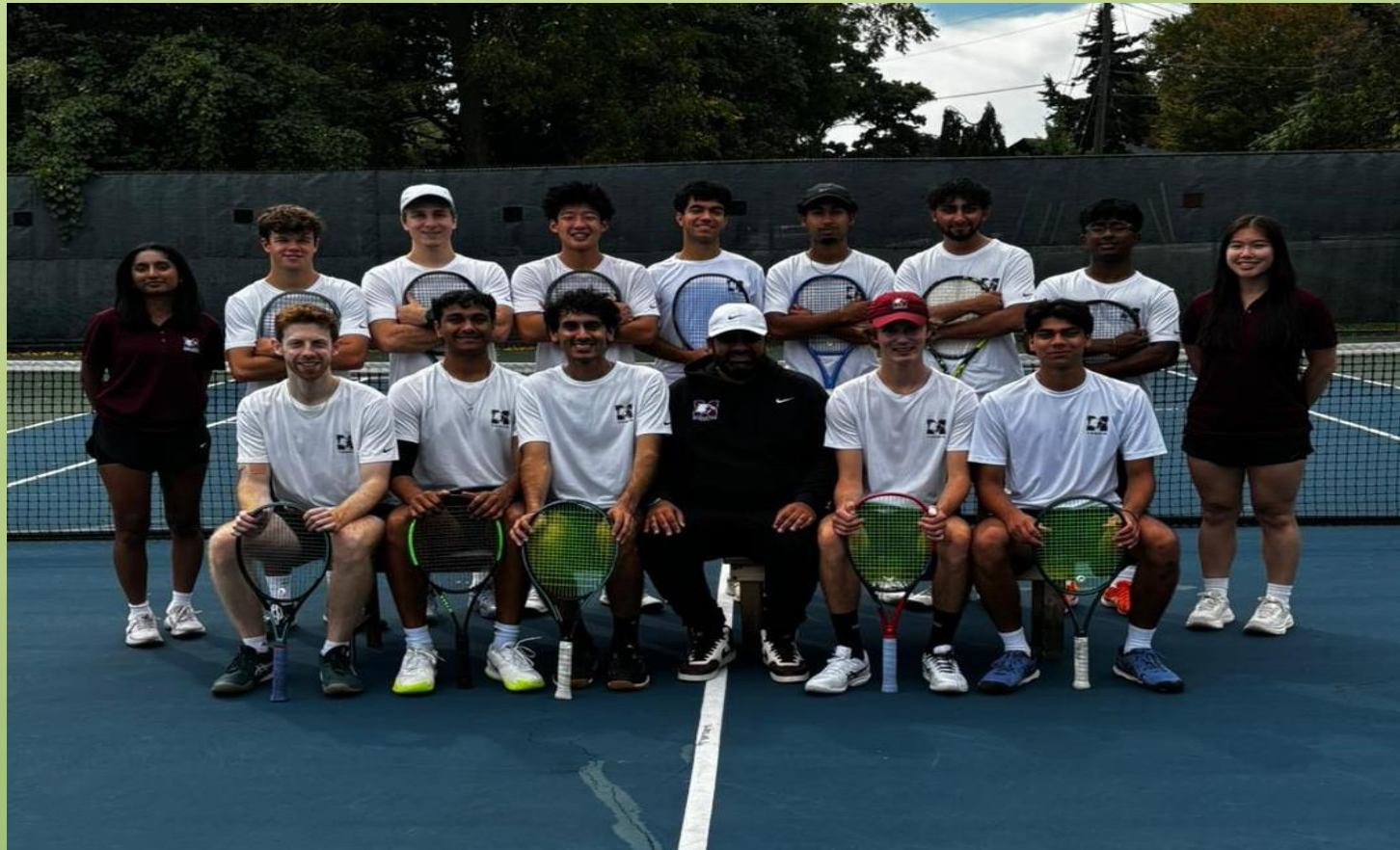
McMaster Men's Tennis Team 2025